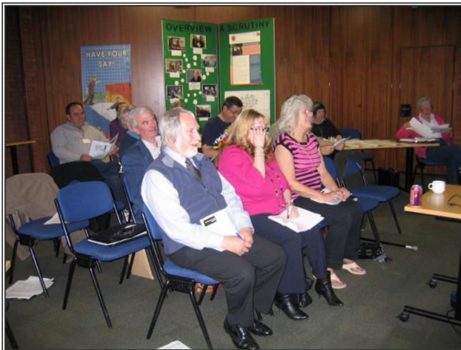
A number of Councillors attended the Introduction to Overview and Scrutiny Training that was delivered in May 2012.