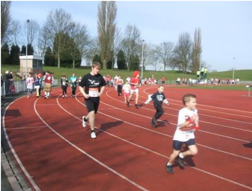
Sport Relief, Redditch

A full update on the action that has been taken to implement the group's recommendations is due to be considered by the Overview and Scrutiny Committee in July 2013.