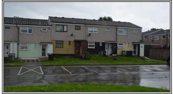
Properties in Woodrow prior to completion of external wall insulation works.

The Committee received an update on action taken to implement the group's recommendations in July 2012. Members were advised that Ombersley Close and Rushock Close, which had been visited as part of the scrutiny review, had been selected for inclusion in the External Wall and Insulation Project for Woodrow, a project that had previously been delivered successfully in Winyates.