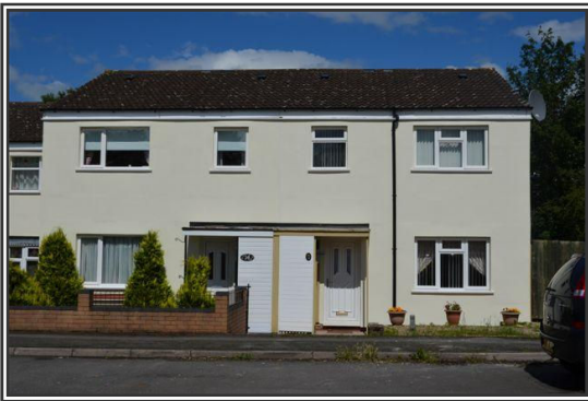
Properties in Woodrow following completion of wall insulation works.

A total of 261 properties were eligible for inclusion in the project including 112 Council properties and 140 private properties. Works included surface insulation, loft insulation and replacing boilers. Members were advised that the works would cost £1.7 million which would be paid for using carbon funding received from the energy company E.ON.